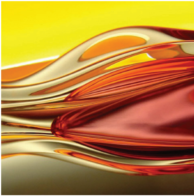
Chromatic Plants, 2011

Hans Kotter was born in Muhldorf am Inn, Germany in 1966, and his work has been exhibited widely throughout Europe and the United States. Highlights include participation in exhibitions at Villa Datris (L'Isle-sur-la-Sorgue, France), Kinetica Museum (London), and the Museum of Contemporary Art (Zagreb). His work is in collections including the Targetti Light Art Collection (La Sfacciata, Italy), Museum Ritter (Waldenbuch, Germany), and Kinetica Museum (London).